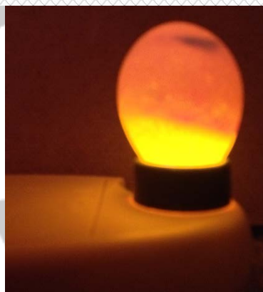
This egg stopped developing within the first week of the incubation process.