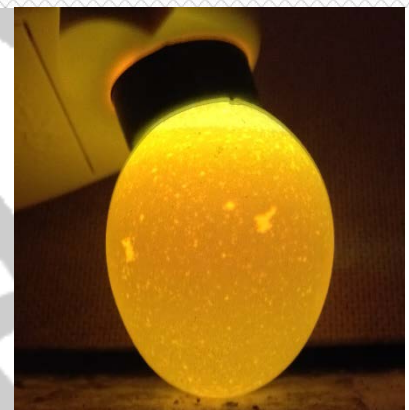
This egg never actually developed or was not fertilized.

Remember, always wash your hands and clean all surfaces that contact poultry products!