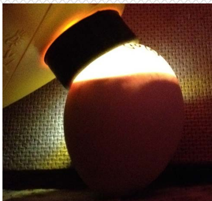
Day 19 of Development