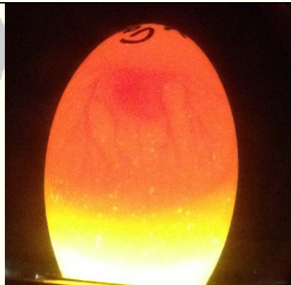
Day 6 of Development